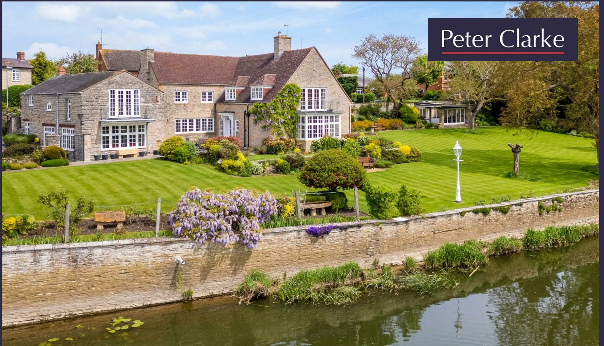
Blythe House and Blythe Lodge Grange Road, Bidford-on-Avon, B50 4BY